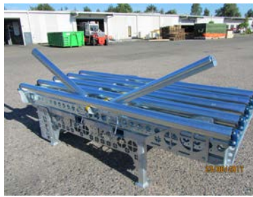
Folding unit up to DN1800 (VM13.1.1)