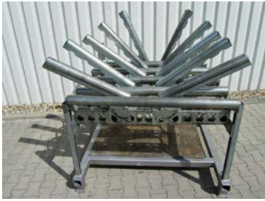
Folding unit up to DN1300 (VM13.1)